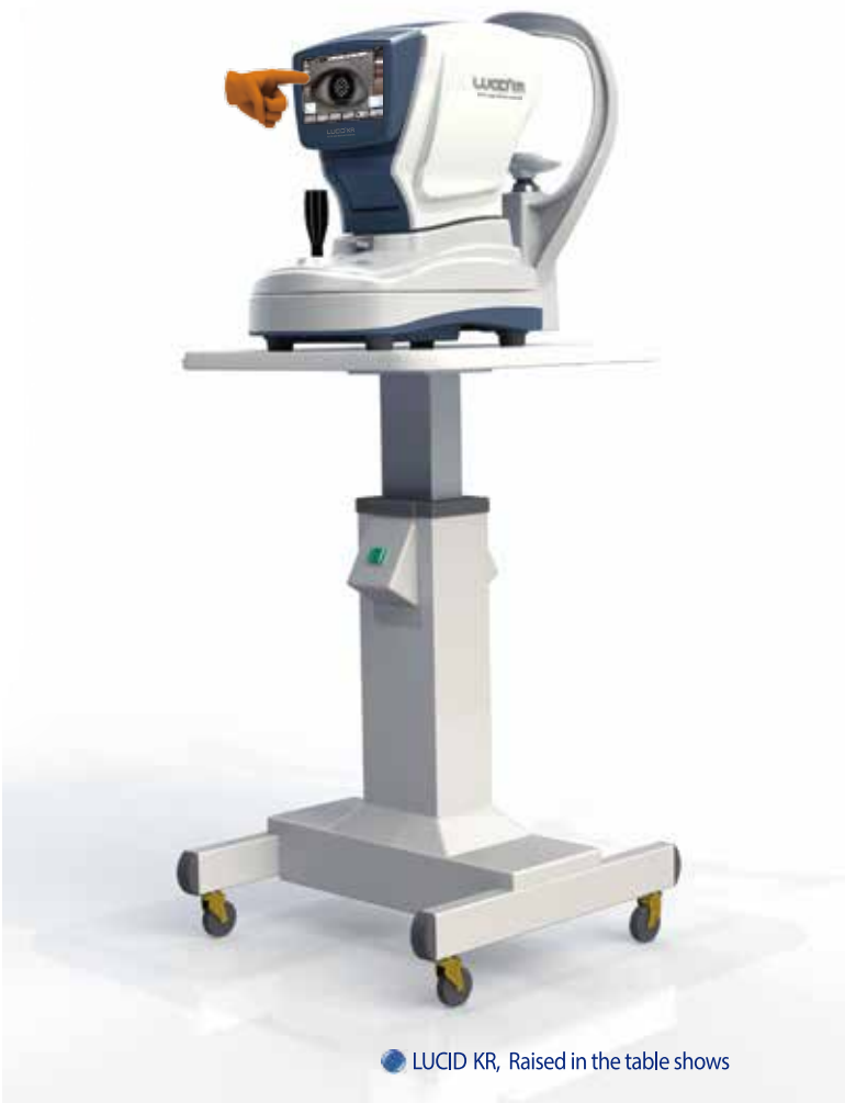
LUCID`KR, Raised in the table shows

LUCID`KR provides the patients with the comfortable measuring environment by adopting Chin-rest and Head-rest with soft material of silicon rubber.